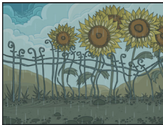
4 Rain Cycles

The Effect Templates 3 Package contains the following: